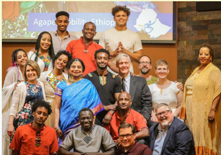
Friends and family make it all happen with Saba's vision.