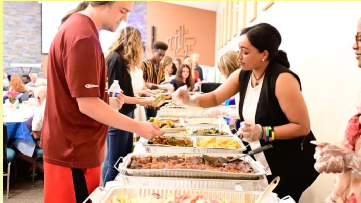
The feast of Ethiopian cuisine.

... time of praising God for his goodness and sharing the love and fellowship of friends and family.