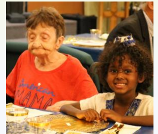
Children of all ages!